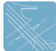
EXHIBIT 1. . INFORMATION VALUE CHAIN